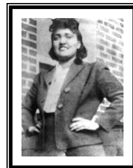
Henrietta Lacks 1920-1951

If you are interested in participating in this book discussion, please register at your local library branch, or call 770-781-9840.